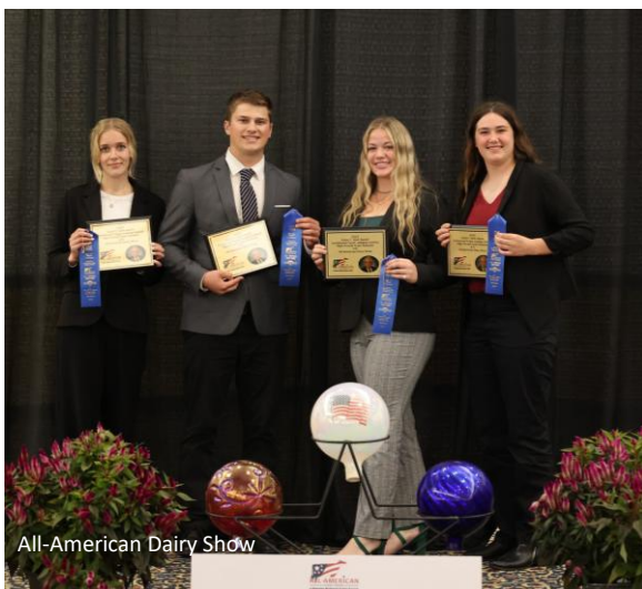
All-American Dairy Show